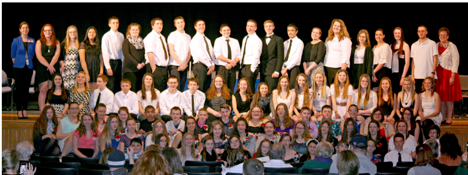
The 2015 National Junior Honor Society