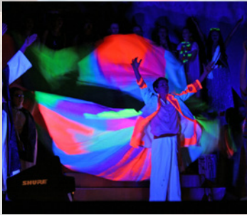
Joseph in his technicolor dreamcoat