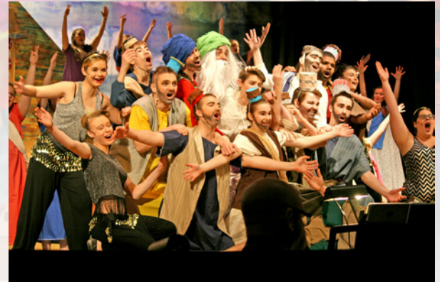
Joseph with his father, brothers and the narrators

*Note: The cast varied by the performance, so the actors cited for these roles performed in the final performance on March 15.