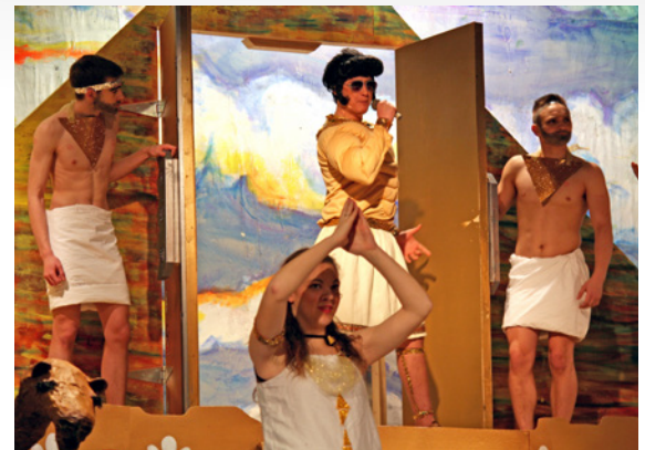
Pharaoh aka Elvis